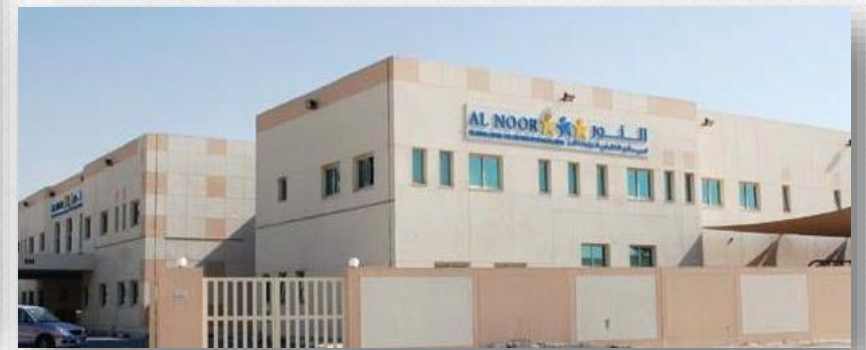
Al Noor School