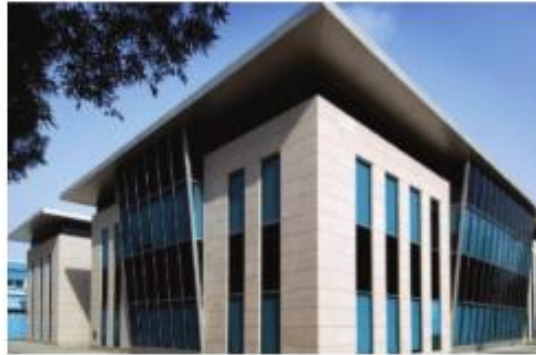
ADNOC Technical Institute