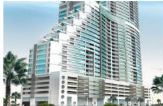
Al Jaber Tower