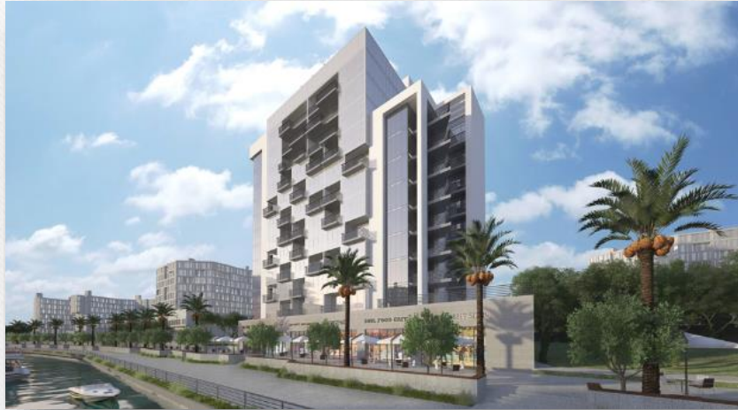
Al Raha Beach