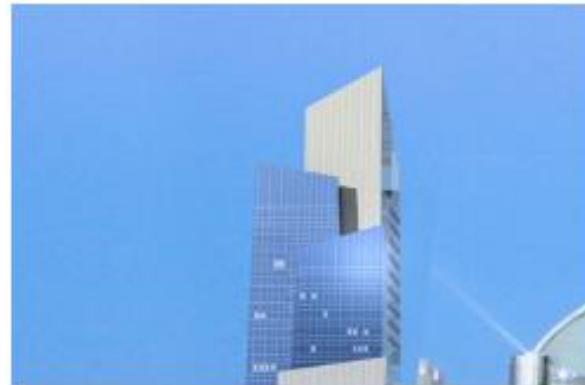
Tahnoon Bin Saeed Tower