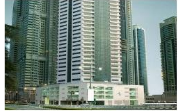
MAG 218 Tower