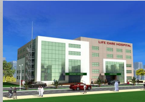
Life Care Hospital