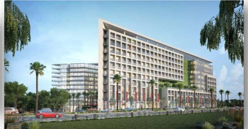
SDW4-C1 Park View Bldg.