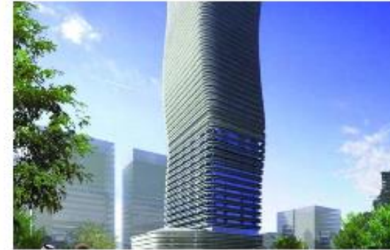
Al Ain Tower