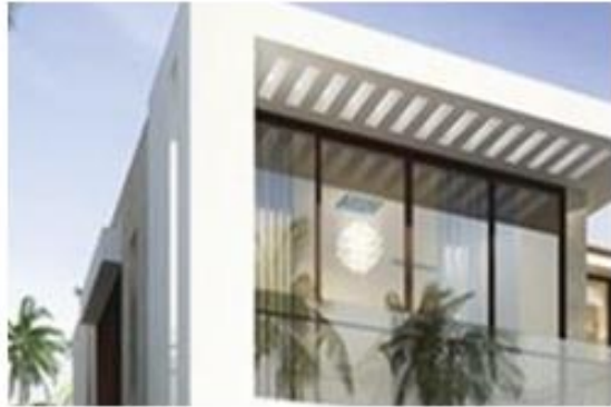
550 Villas at Akoya Park by DAMAC