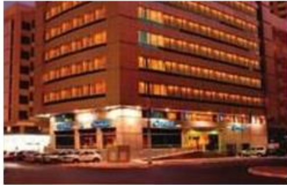
Crystal Hotel - Al Salam