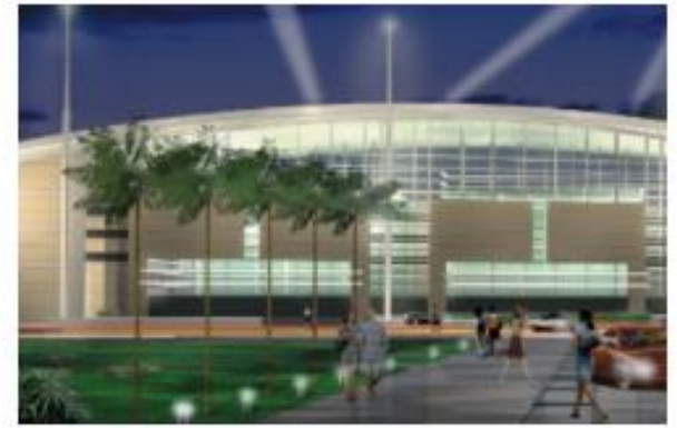
Yateem Center Day Care Surgery