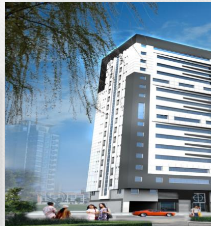
Commercial & Residential Bldg. - CRC