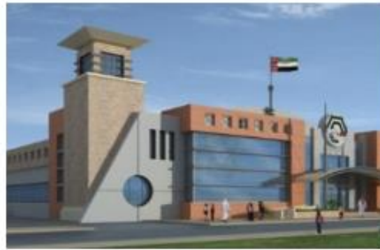
Al Noor Rehabilitation for Special Needs Center