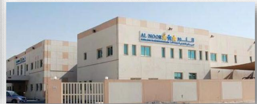
Al Noor School