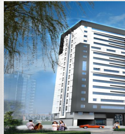
Commercial & Residential Bldg. - CRC