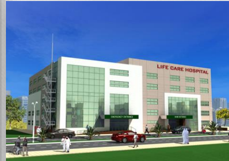
Life Care Hospital